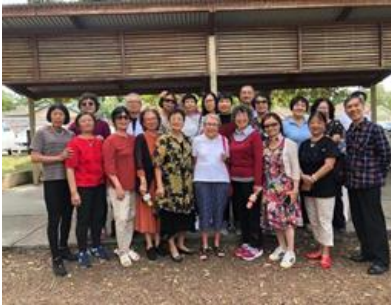
(Singing in the park)

Apart from my annual leave on the last 2 weeks in January, I've various meetings with different stakeholders in the community to connect and explore the possibility to collaborate in the future. I'm the chairperson of the Eastwood Chinese Senior Citizens Club (Founded in 1991). I believe that we should try our best to connect with other organisations to serve the wider community. I represented the church to meet and talk to people (both community and 2pm) and tell them who we are, what we are doing and explored the opportunity to work together to serve the community. Most people from the wider community not knowing us or our ministry especially those "outsider". A Chinese singing group normally in the park from the community would like to start their activity in our church premises when possible. (will commence on 13 April at 11-1pm at East and West Room)